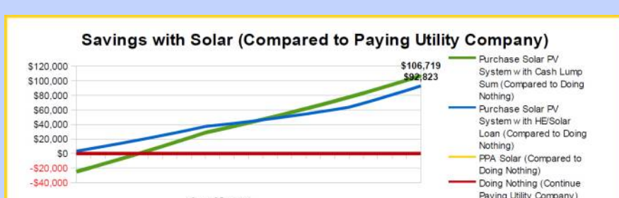
Overview – 25 Years of Savings Potential