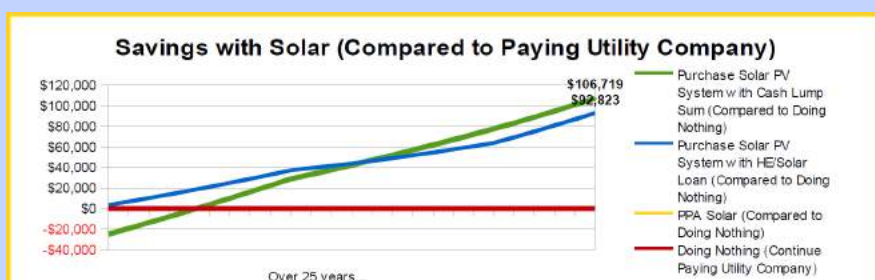
Overview – 25 Years of Savings Potential